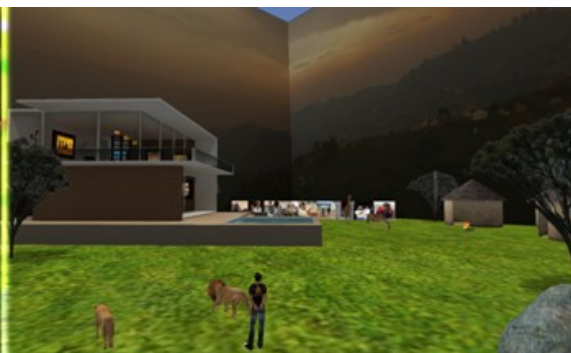
LSA's Second Life AIDS Center: Here, people will be able to experience the HIV Positive Experience online